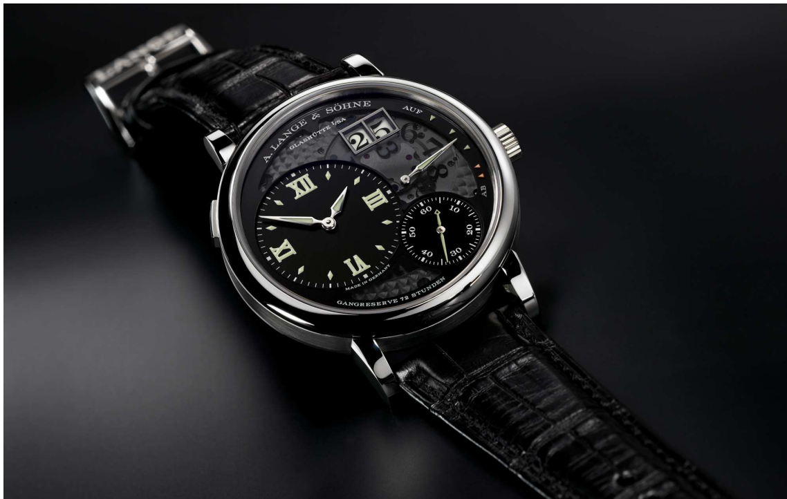
Legible even in the dark: GRAND LANGE 1 “Lumen”

The limited GRAND LANGE 1 “Lumen” offers enlightenment: a semi-transparent dial exposes the ingenious mechanism of the first luminescent outsize date display by A. Lange & Söhne.